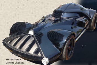
Yes--this was a Corvette Originally.