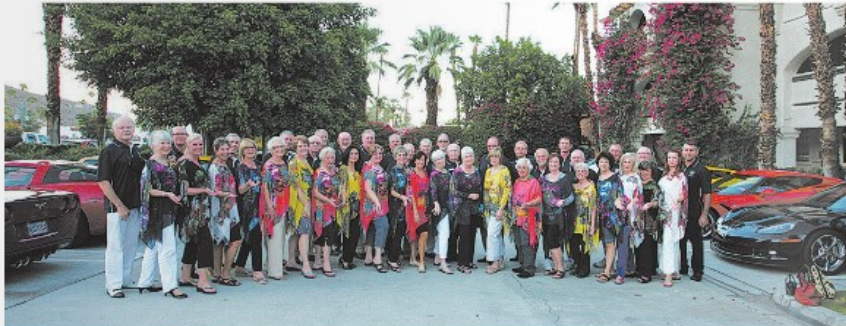
The Corvette Club of Arizona hosts many social gatherings and car shows, including the upcoming Thorobred Thunder All-Chevy Car Show on Nov. 7

This article was in the October 2015 edition of the Tumbleweed news. The full publication can be found here , and the article appears on page 6.